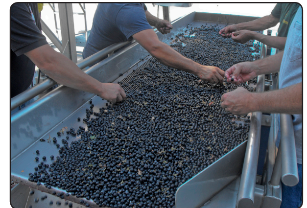
Post De-stemmer Sorting Table