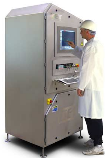
G6 Control Module