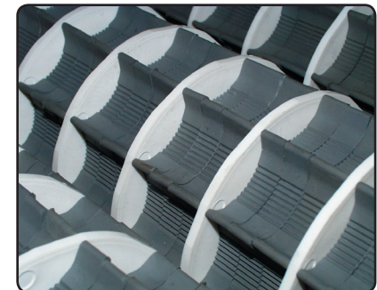
RSG Sizing Pockets