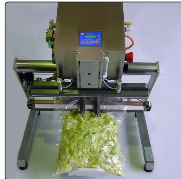
AVSealer on bench stand

Call Key for price and delivery information or order online at www.key.net .