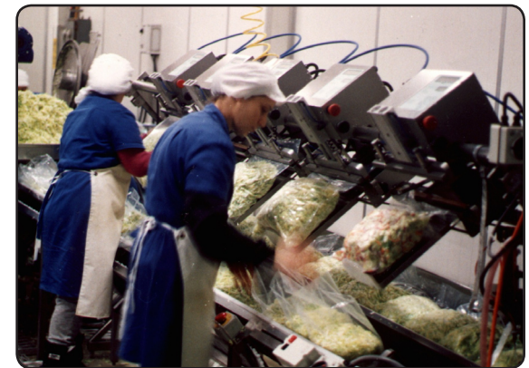
AVSealer system on flexible rack-mounted floor stand system