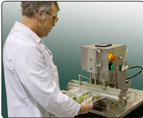
Loading bags is easy with the AVSealer

The AVSealer packaging and sealing machine has a programmable range of vacuum pressures and temperatures for consistent sealing of a wide range of products including wet or dry lettuces, cut vegetables, fruit, fresh herbs and other small produce.