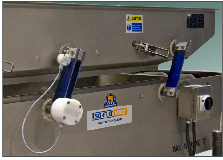
SmartArm<sup>®</sup> Installed on an Iso-Flo<sup>®</sup>