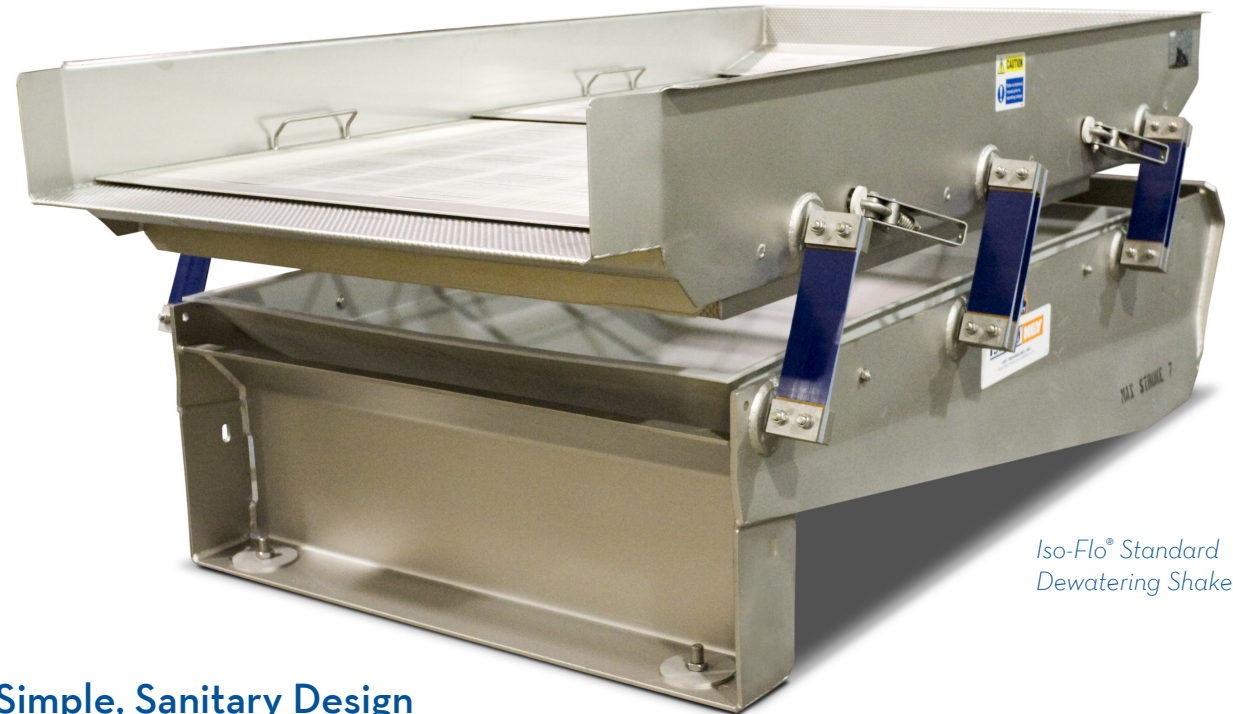
Iso-Flo® Standard Dewatering Shaker